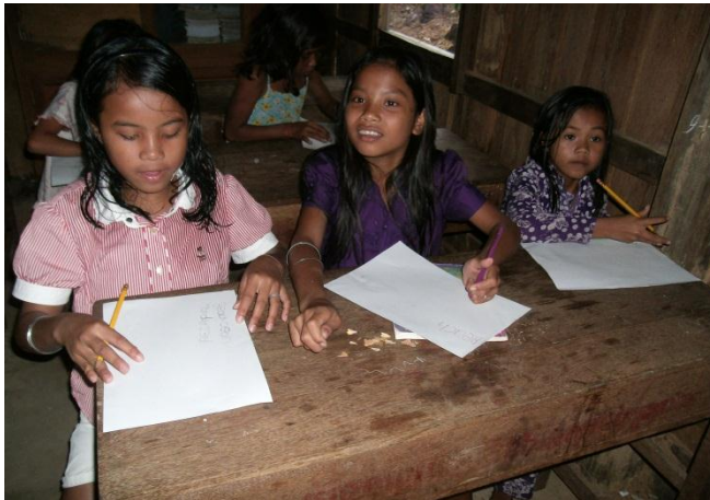
Children from the local school design posters to advertise the beach clean-up