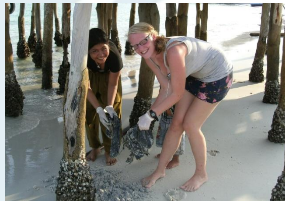
Enthusiastic volunteers clean the beach!

During the clean-up the team gathered paper, plastic, glass, rope and even some old clothes. There are several benefits to carrying out a beach-clean like this; firstly, it keeps the beach where we all live looking beautiful; secondly, it stops the rubbish being washed into the sea where it can damage or kill marine creatures such as coral and fish; and thirdly, it raises awareness of these issues within the local community. We would like to take this opportunity to thank everyone who gave their time to this good cause and made the event such a success.