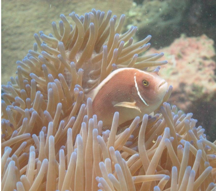
Pink Anemonefish (Amphiprion perideraion)

This month, we are very pleased to be able to present a report on the species recorded on the reefs around Koh Rong and Koh Rong Samloem along with a selection of images and videos to our partners at the Cambodian Ministry of Agriculture, Forestry and Fisheries (MAFF). The images, all taken by Coral Cay Conservation staff and volunteers represent the hard coral, fish and other invertebrate species which have been recorded in the area thus far.